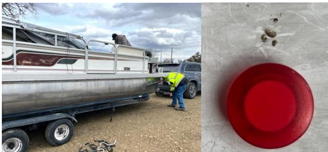
Figure 2 and 3. Boat intercepted at the ODFW’s watercraft inspection stations. Boat was inspected and quagga mussels found. ODFW decontaminated the boat on-site and re-inspected with no additional mussels found.

During the inspection process, if an inspector observes a vessel to be contaminated with any aquatic invasive species, a decontamination is immediately performed on-site. Three hundred and thirty-six of the vessels inspected were contaminated with aquatic vegetation, marine or freshwater organisms, or other biofoulings. We were able to perform a simple decontamination on these vessels. Nine vessels were contaminated with quagga or zebra mussels, and we performed a full decontamination (hand removal, followed by hot water high-pressure) on-site (Figure 2 and 3). These vessels originated from Arizona, Nevada, and Texas. If the vessel was remaining in Oregon, a follow-up inspection/decontamination was performed at the owner’s residence before the vessel was launched, or if the watercraft was going to another state, that other state was notified, and another inspection may have been performed.